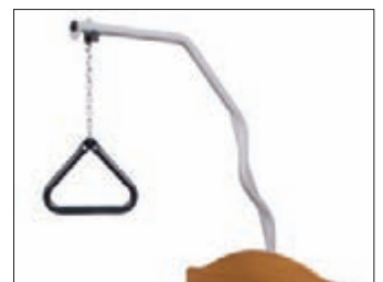
ZA79000 (for use with ZA78100 Trapeze Bar)

Optional trapeze adapter allows for easy attachment of trapeze system to headboard within easy reach for residents for repositioning themselves.